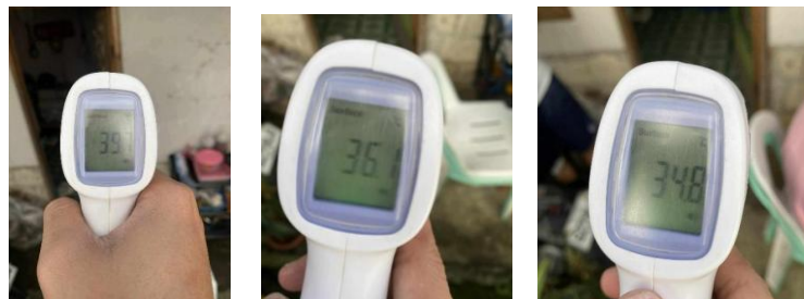
Figure 3. Thermal performance for CPI.

The thermal performance of the CPI samples was evaluated by measuring surface temperatures between 11:00 AM and 3:00 PM, a period corresponding to the peak solar radiation and ambient temperature of the day (figure 3). This interval was specifically chosen because it represents the worst-case thermal conditions that building surfaces typically experience. According to Hu et al. (2025), cumulative solar heating during the morning often leads to the highest outdoor and surface temperatures in the early afternoon. Similarly, some other findings (Xi et al., 2025) indicate that daily maximum temperatures generally occur between 12:00 PM and 3:00 PM. By conducting measurements within this timeframe, the study ensured that the collected data accurately reflects the maximum heat stress that indoor and outdoor surfaces could encounter.