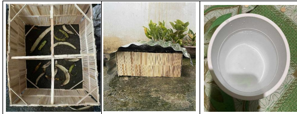
Figure 2. Pest and mold testing of CPI.

Figure 2 illustrates the three experimental setups used to evaluate the pest, mold, and moisture resistance of the CPI samples under simulated and real environmental conditions. The first setup, shown in the figure, utilizes banana peels placed inside a wooden-framed enclosure to create a humid and nutrient-rich environment that accelerates biological activity. This condition is intended to promote mold growth and attract pests, allowing for close observation of any surface changes, fungal formation, or material deterioration on the CPI samples.