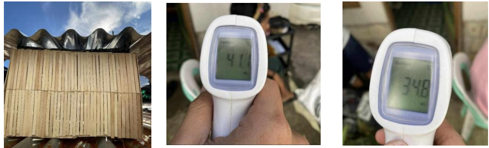
Figure 5. Thermal performance testing.

The results (figure 5) indicate that the CPI materials made from recycled PET, HDPE, and PP are effective in enhancing insulation performance even under intense heat conditions. By keeping indoor temperatures lower, the CPI not only improves comfort but also has the potential to reduce energy consumption in buildings by decreasing the need for active cooling systems. This demonstrates the practical applicability of recycled plastic insulators in sustainable building design, especially in regions with high ambient temperatures.